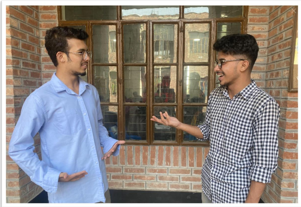
My friend was at laughing and asking me what happed?