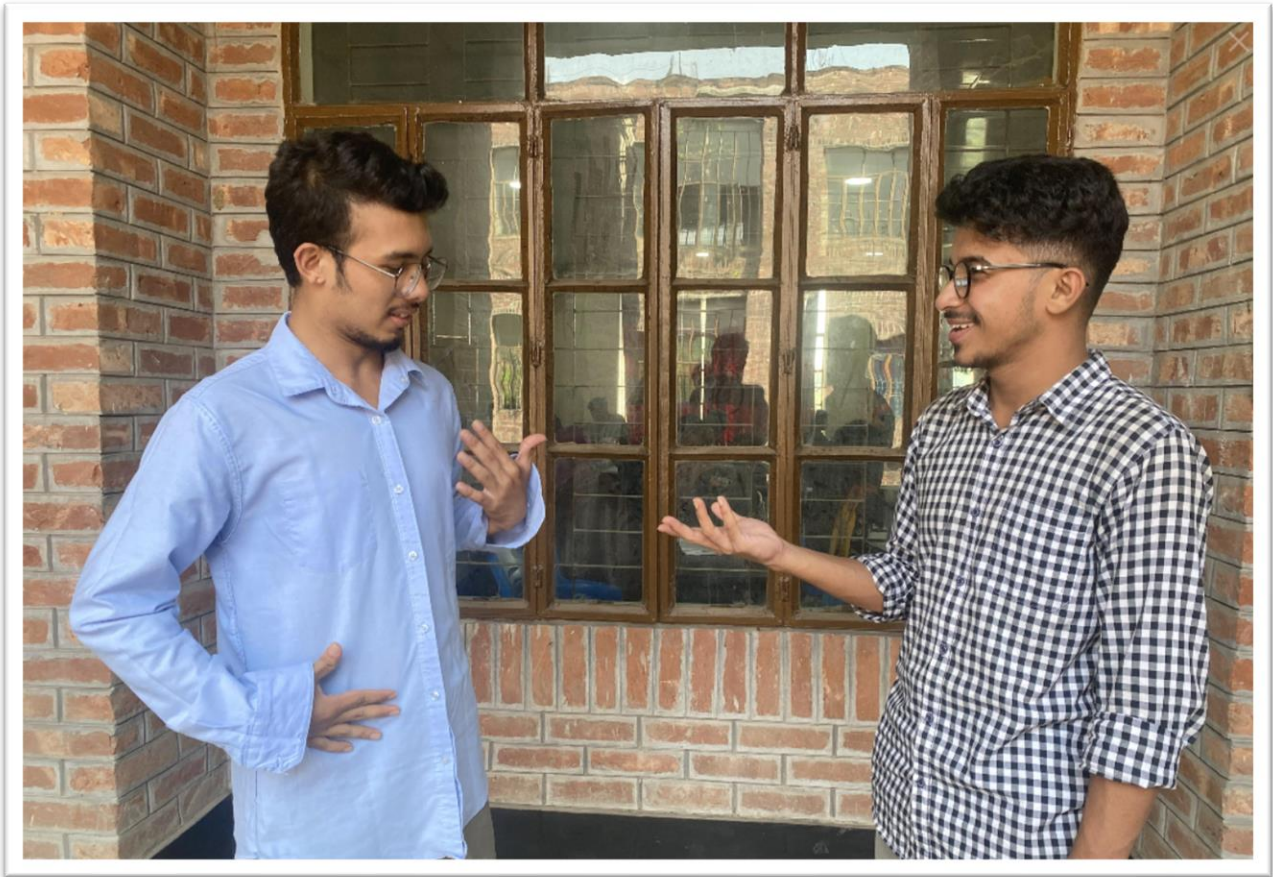
I was explaining him about the Pgc2023 Challenge.