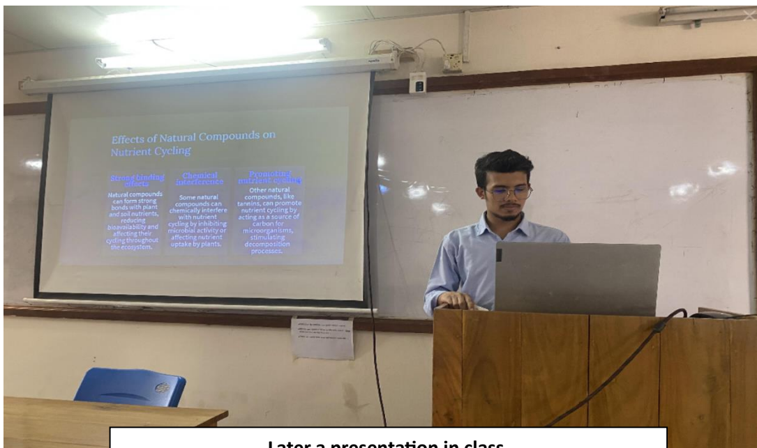
Later a presentation in class.