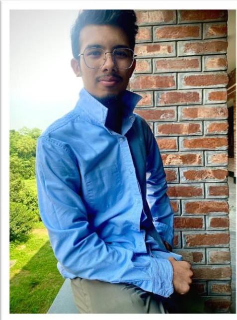
Inside out pose.