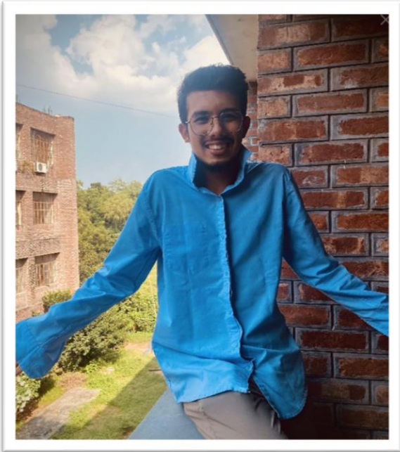
Went to University