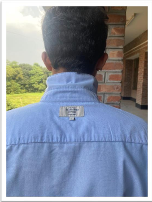
The shirt I am wearing today.