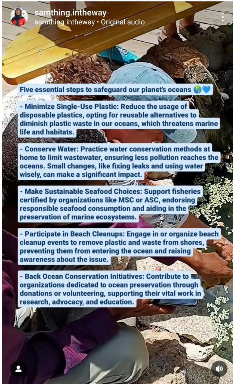
samthing.intheway samthing.intheway · Original audio