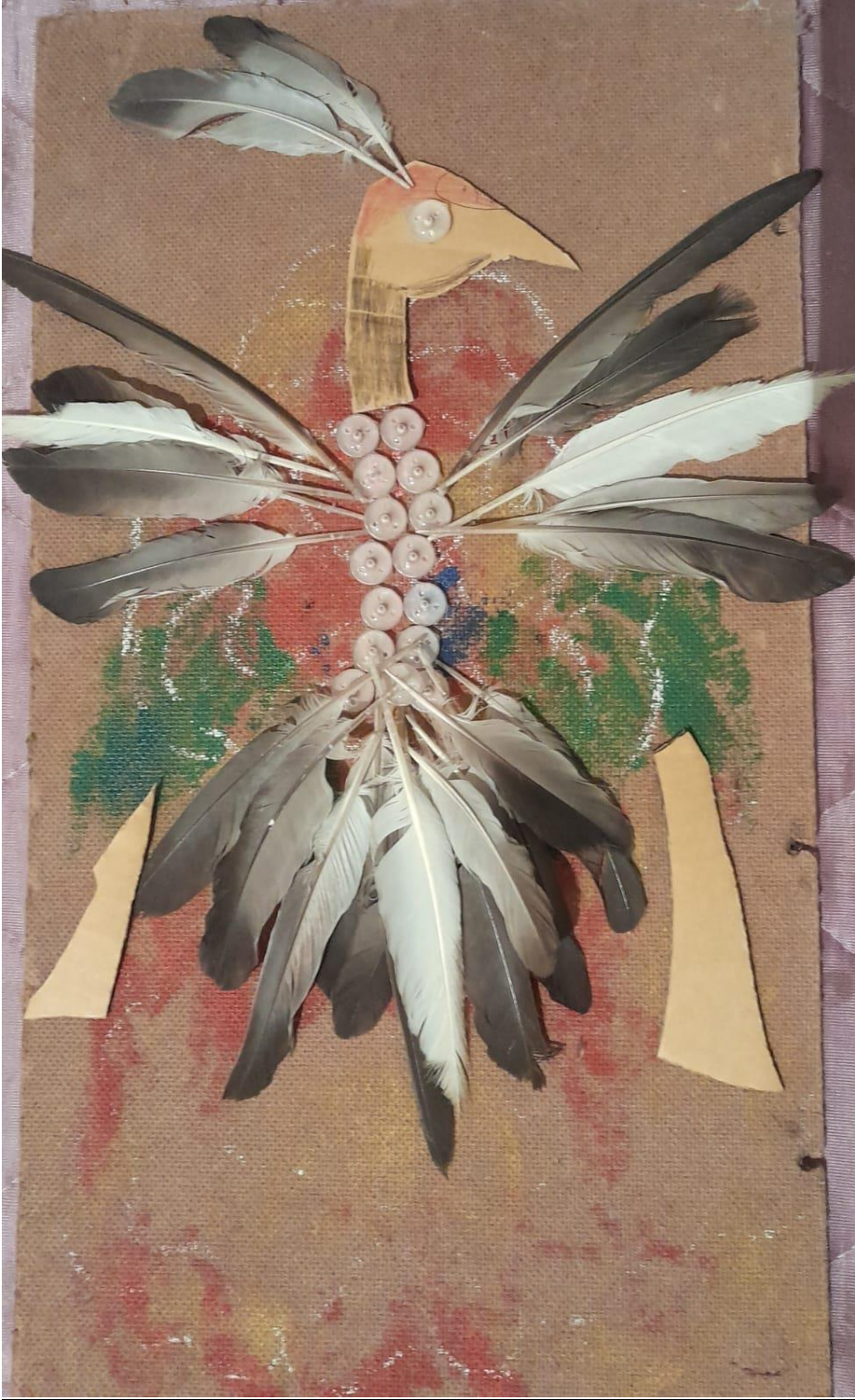
Picture of my artwork