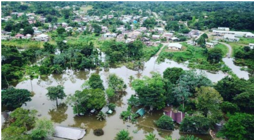
(General Bureau of Statistics Suriname, 2022)

According to Kevin Headley, the greengrocers' plant on higher plant beds than usual. Water systems are also used to keep crops moist during dry periods. Planting in other ways is also being looked at, such as planting in greenhouses with a focus on certain crops such as peppers, tomatoes, and lettuce.