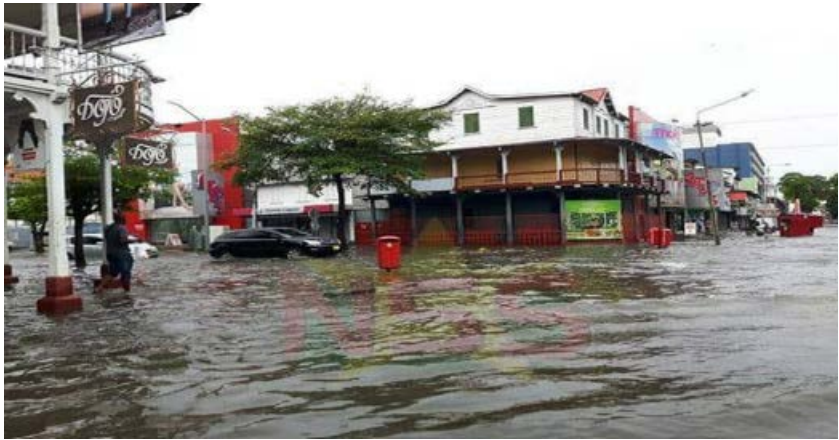
(General Bureau of Statistics Suriname, 2022)