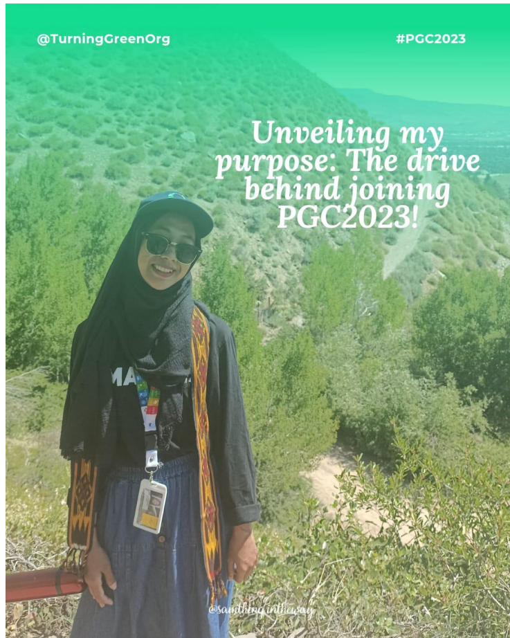
Photo of myself outside in nature with a short caption about why I am participating in PGC 2023.