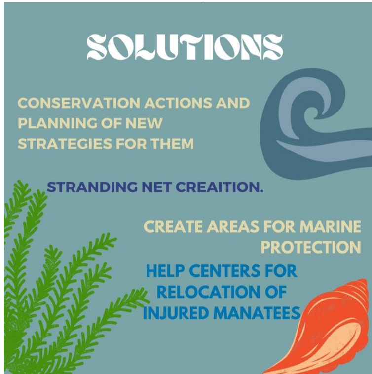
Social media post.