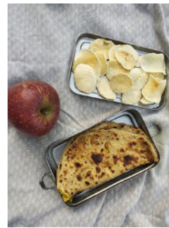
homemade snacks in stainless steel container