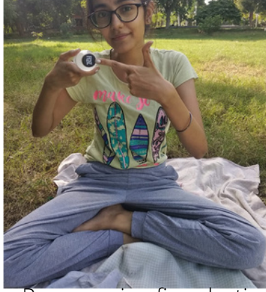
Repurposing fizz plastic bottle