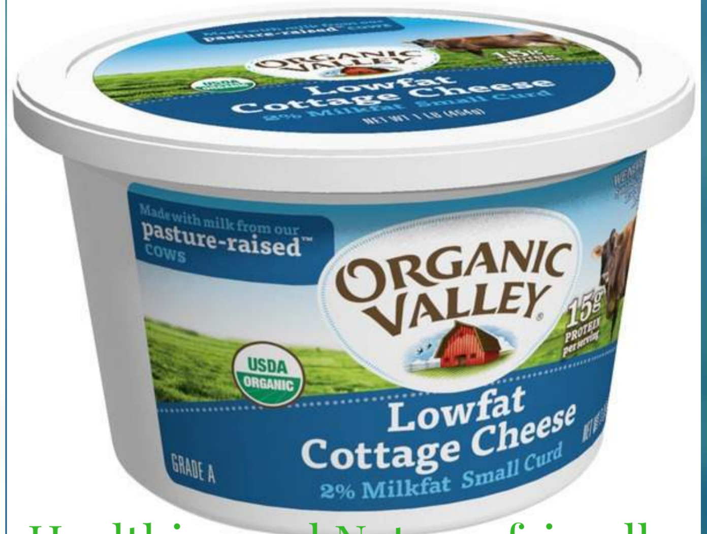
Healthier and Nature-friendly

Organic is spelled with ingredients – NOT letters