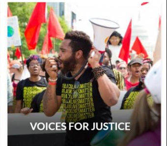
VOICES FOR JUSTICE