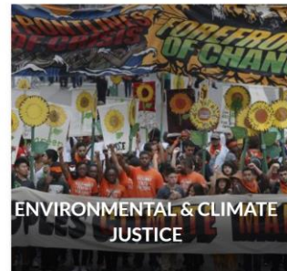
ENVIRONMENTAL & CLIMATE JUSTICE